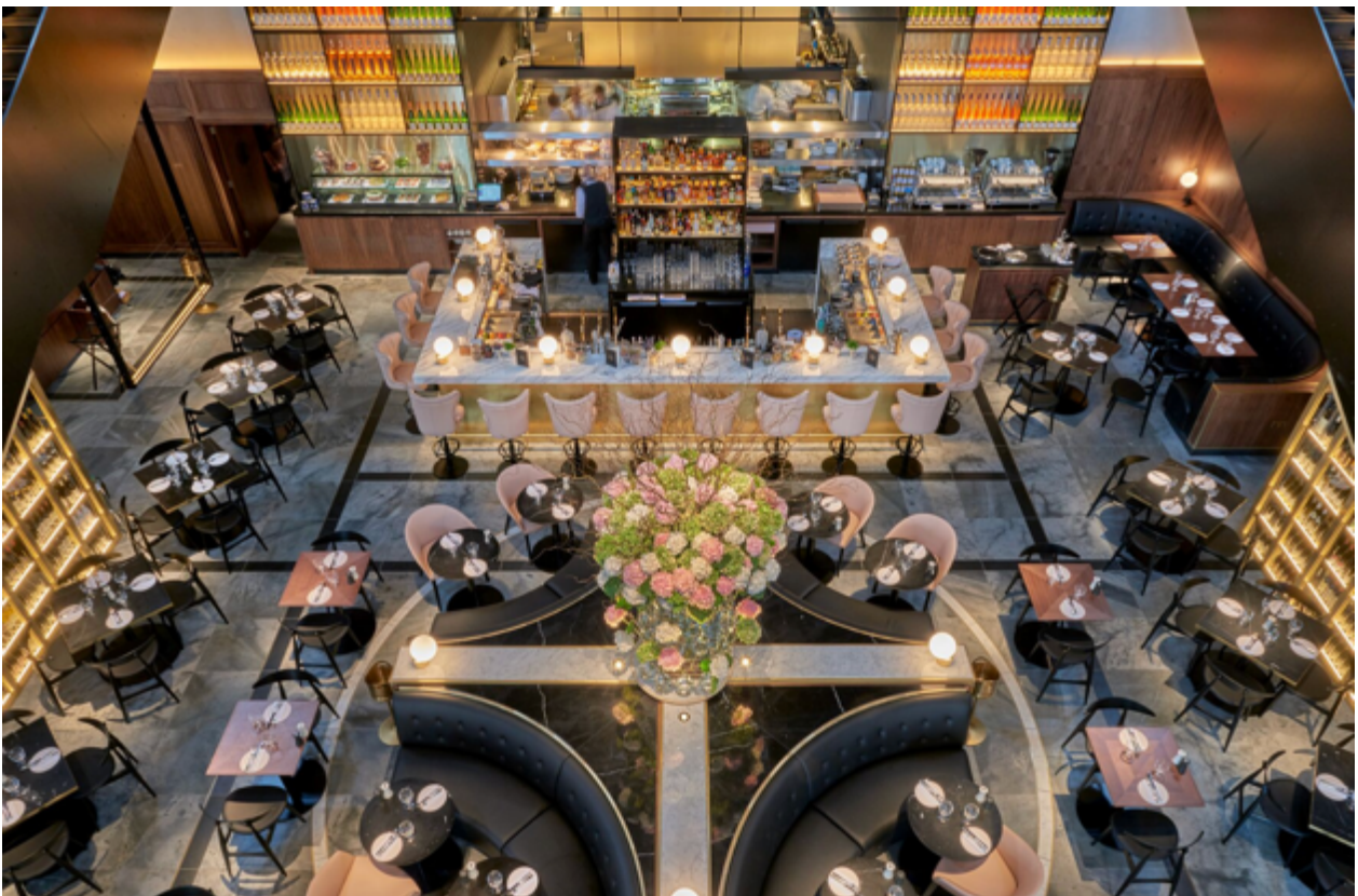
Above: German Gymnasium

KXCQ is a treat for the tastebuds as well as the eyes, from elegant fine dining to the latest street food trends and pop-ups.