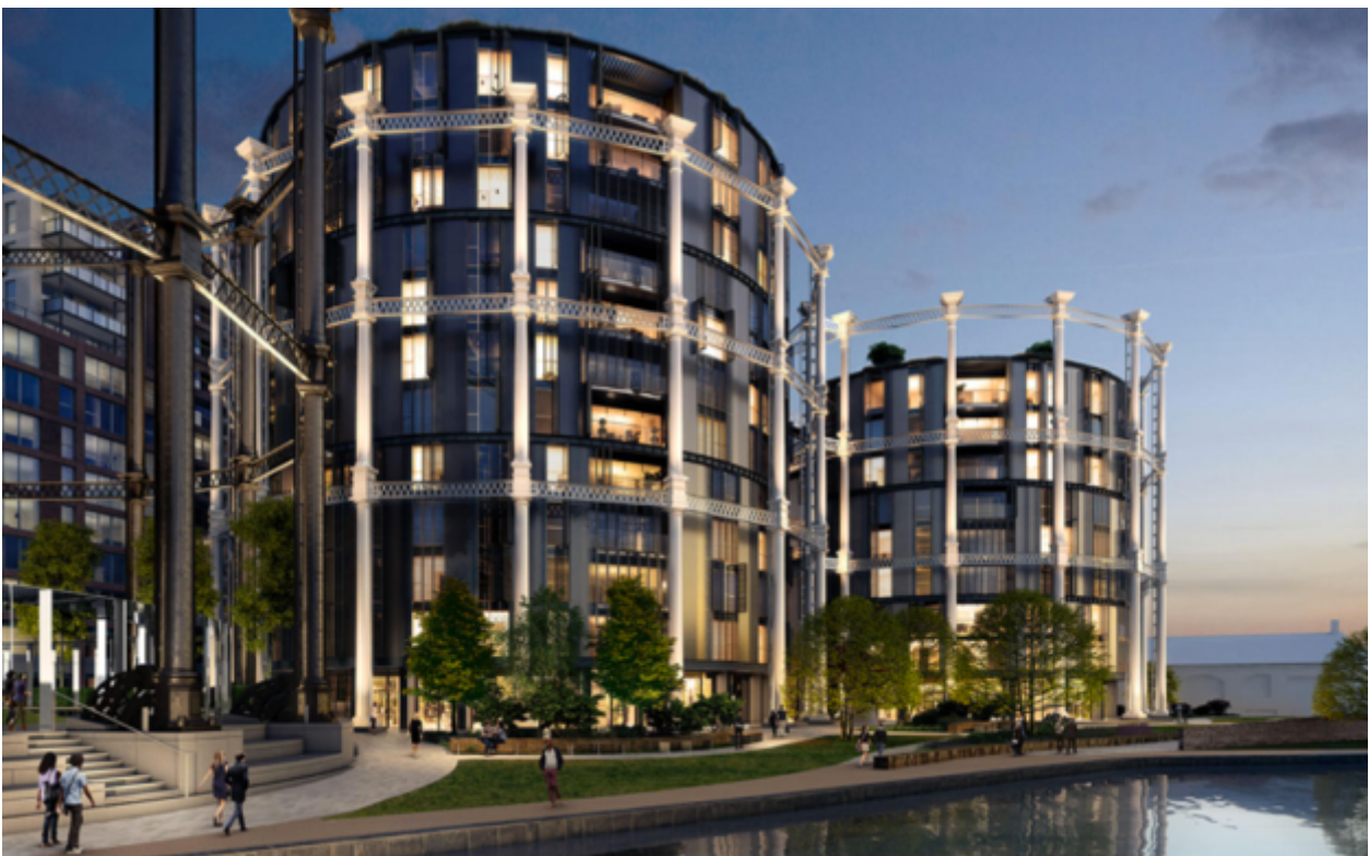
Above: King's Cross Gasholders

Explore these with New London Architecture's self-guided tour, which can be found on the reverse of the map available for download here: thedesignjunction.co.uk/kxcg