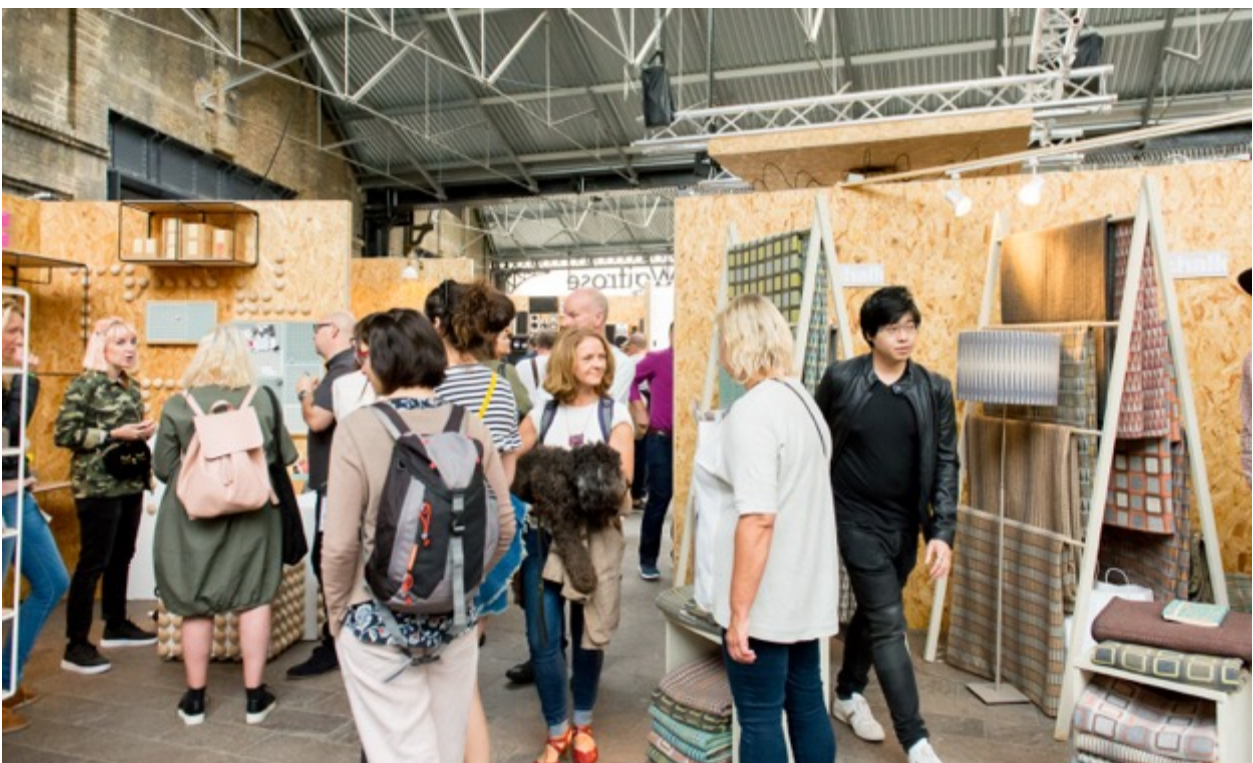
Above: The Canopy 2016

King's Cross is a fast-growing shopping destination for both independent boutique brands and respected labels. These will soon be supplemented by further retail at Coal Drops Yard, near Granary Square.