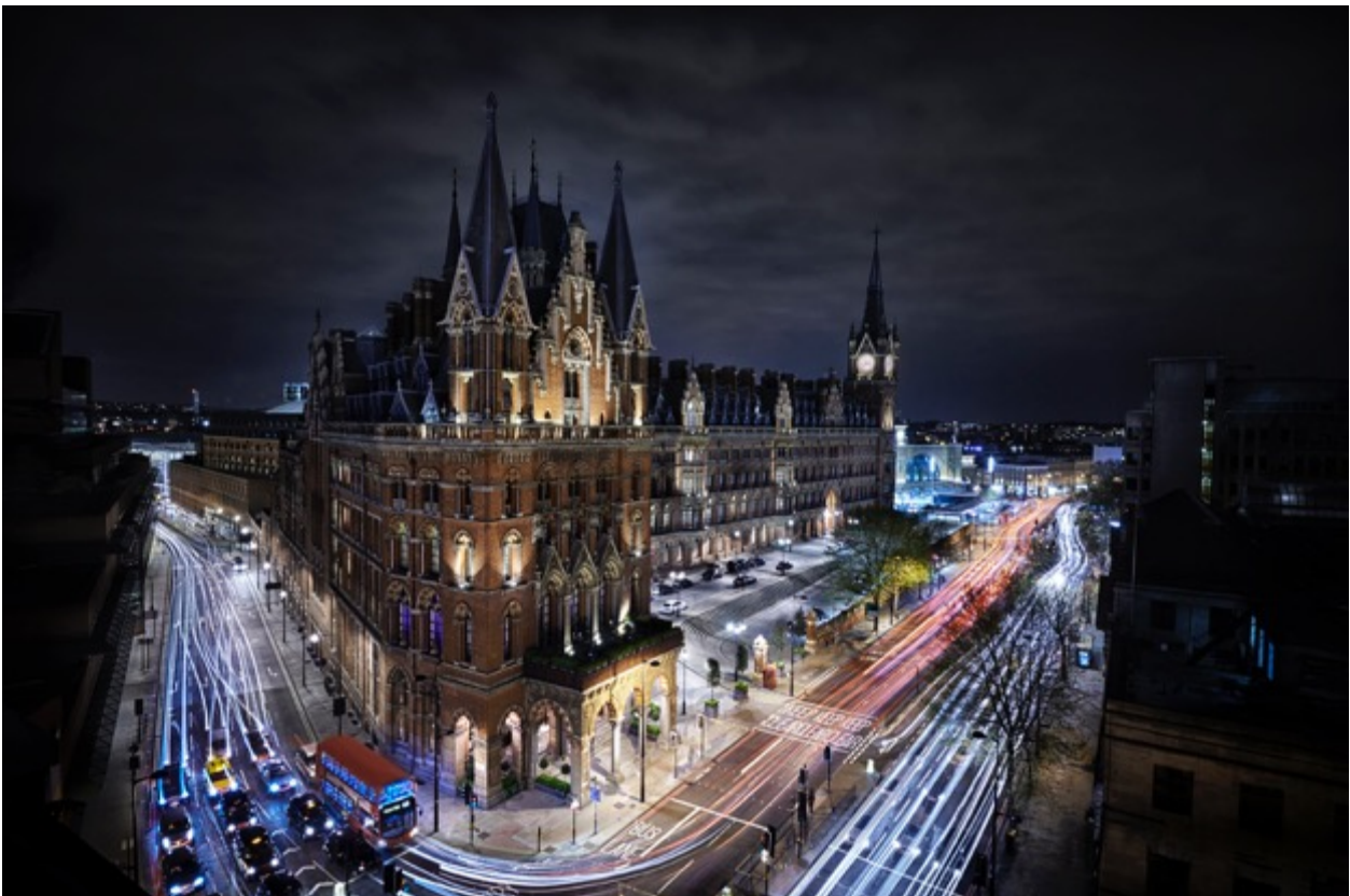
Above: St Pancras Renaissance Hotel & Spa

Victorian Gothic splendour meets contemporary style at this luxurious five-star hotel, housed in the Sir George Gilbert Scott-designed Midland Grand Hotel at St Pancras. As well as sumptuous suites and a subterranean spa, the hotel boasts a range of restaurants that make the most of the building's grand interior.