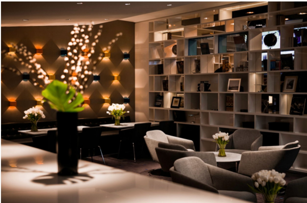
Above: Pullman London St Pancras – designjunction's headline hotel partner

Travellers are spoilt for choice with design-led hotels in King's Cross. Located close to both St Pancras International and the King's Cross and St Pancras domestic railway stations, the King's Cross district is the ideal place to stay whilst visiting London from the Continent or elsewhere in the UK.