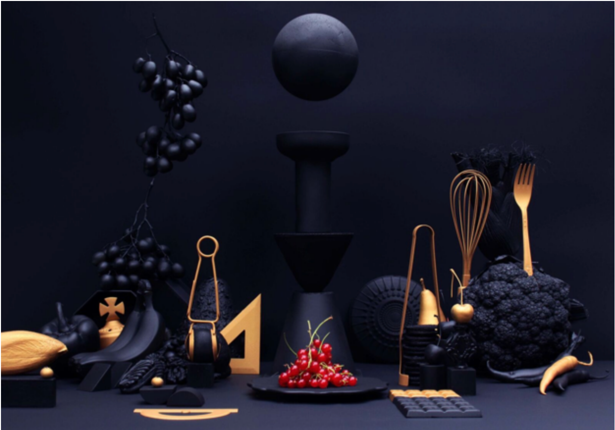
Conran + Partners x Studio Appétit presents The Food Religion