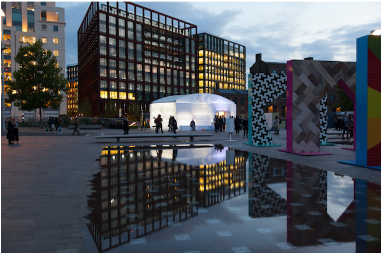
Granary Square, designjunction 2017