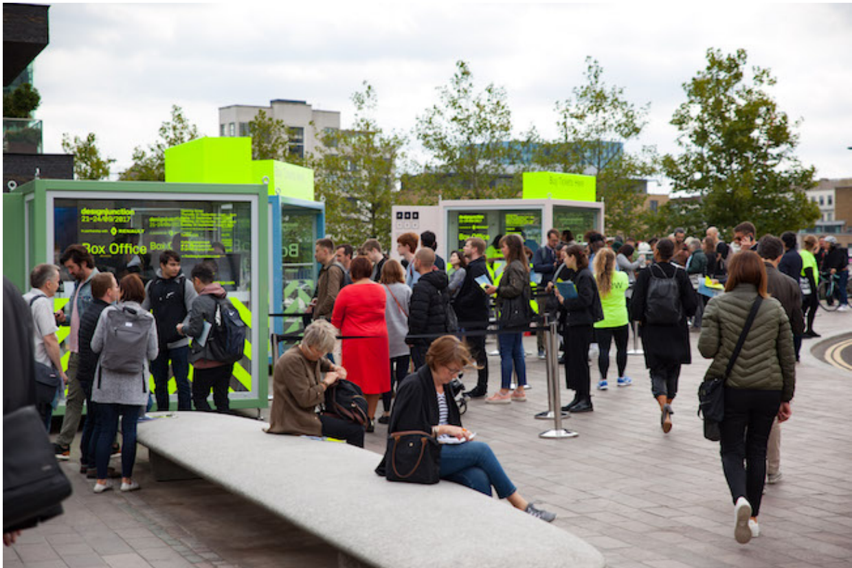
Box Office designed by Remote Possibilities at designjunction 2017

Attracting over 27,000 visitors in 2016, this year designjunction expands its trade offering, with new pavilion Cubitt Park . The show also continues to present across four more areas; Cubitt House – furniture and lighting, Granary Square and The Crossing - feature projects and installations, as well as The Canopy – the show's retail destination.