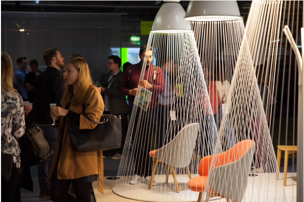
Cubitt House at designjunction 2017