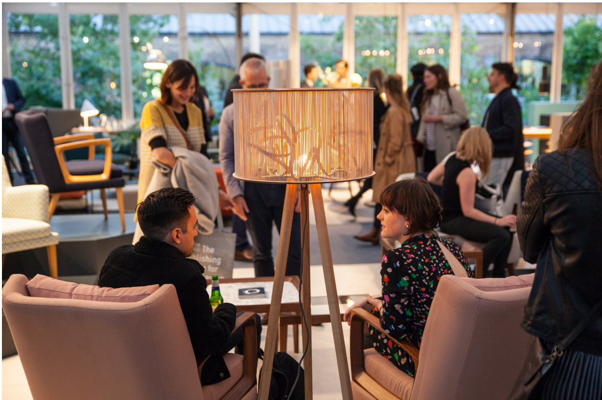
Cubitt House at designjunction 2017

designjunction also welcomes a variety of exciting collaborations. Kickstarter and the Turner Prize-winning collective ASSEMBLE welcomes its immersive café in The Canopy, showcasing SPLATWARE , a line of limited edition ceramic tableware made by Granby Workshop . Lighting up The Crossing, is the BLACKBODY x HAVILAND 'Helen, Light & Porcelain' bespoke chandelier. On the other side of the square in Cubitt House, Breather collaborates with Modus to create a pop-up workspace for the show's trade and press visitors. In Cubitt Park, designers Eley Kishimoto and Kirkby Design have created a new collection of furniture and wallpaper in Eley Kishimoto's styled patterns. Studios 2LG and Custhom also launch their latest wallpaper collection, a collaboration that will be located in Cubitt Park's interactive café.