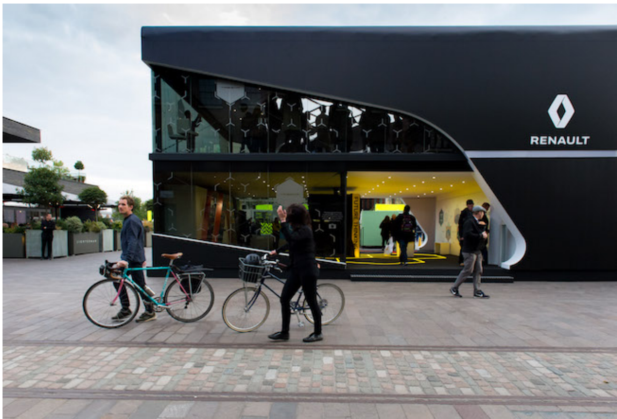
Renault UK bespoke interactive structure on Granary Square at designjunction 2017

designjunction also welcomes the launch of TENPLO, a new range of modular, brutalist inspired concrete furniture designed by Maynard for leading manufacturer Marshalls , bringing seating, lighting and cycle parking to the area outside of The Canopy.