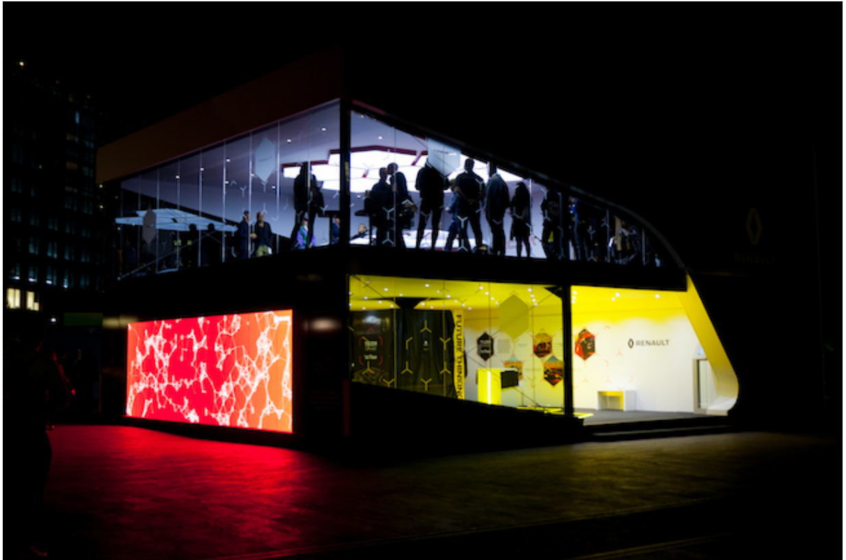
Renault UK bespoke interactive structure on Granary Square at designjunction 2017