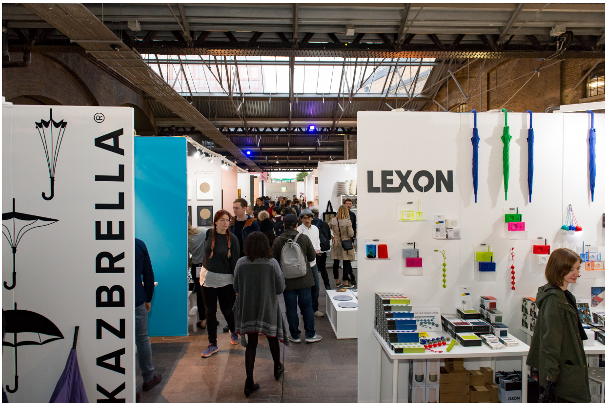
The Canopy at designjunction 2017