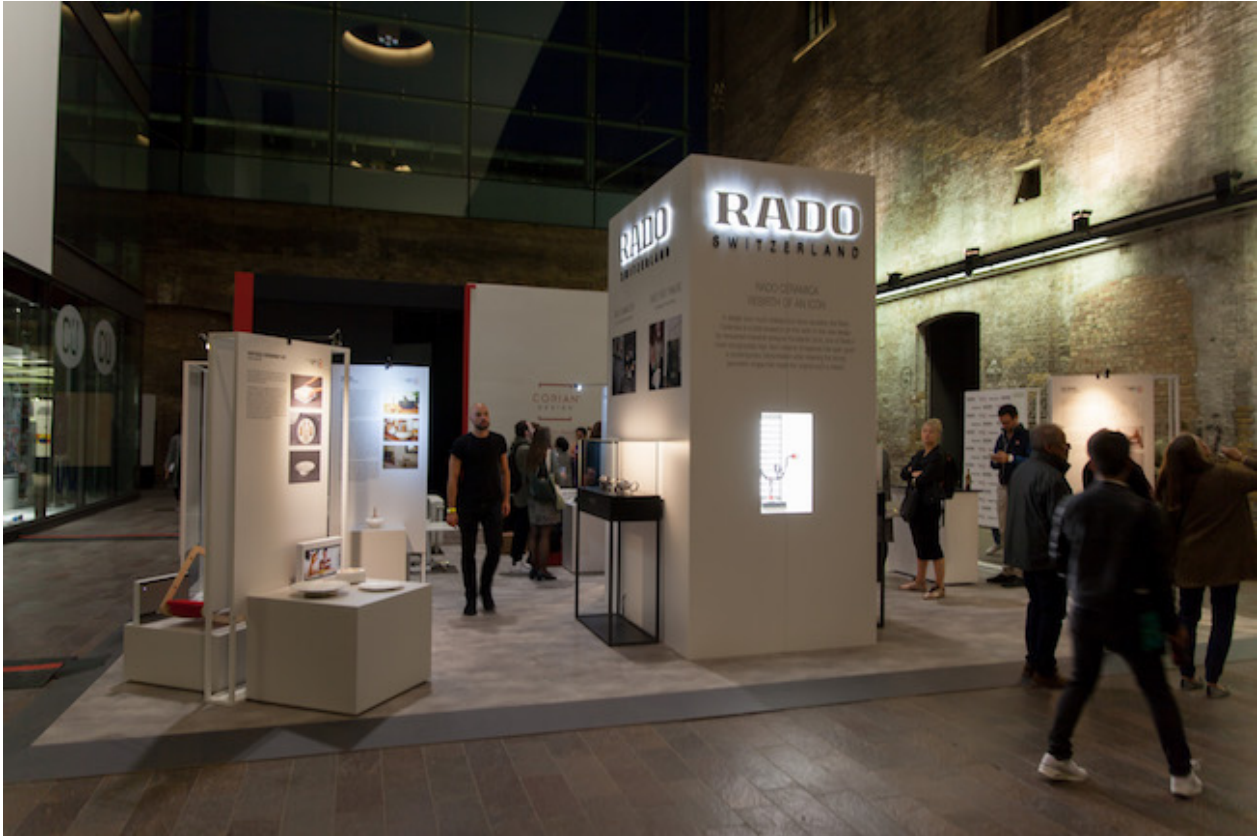
Rado Star Prize UK competition, The Crossing, designjunction 2017

The Crossing , an area that runs through the centre of Central Saint Martins (CSM), is home to the UK's first-ever Rado Star Prize competition, targeting the next generation of young British designers. The design-driven watch brand, together with a leading panel of industry judges, have shortlisted ten designers to showcase their works on the theme 'Design Meets Time' with the winner being announced tonight at 6.45pm (Thursday 21 September).