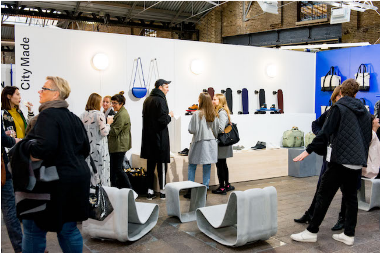
The Canopy at designjunction 2017